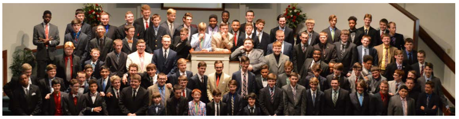
The Foundation Guys for 2017