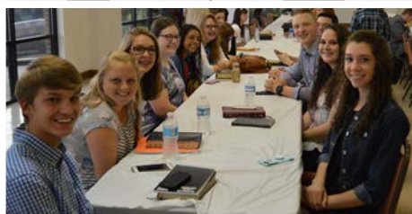
Foundations friends are friends for this life and eternal life!