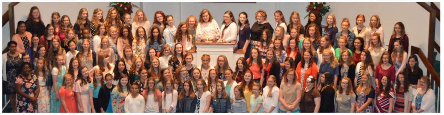
The Foundations Gals For 2017