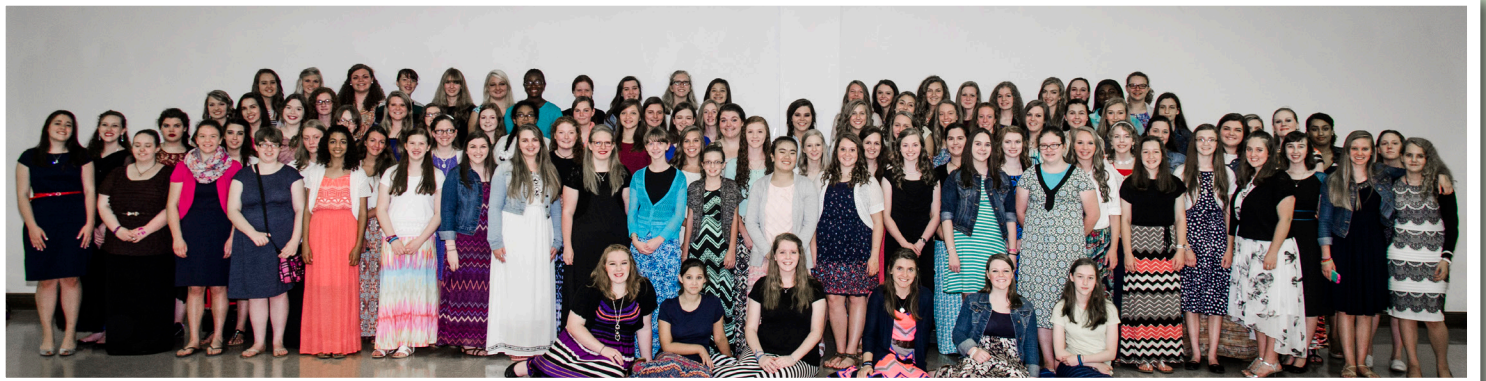
Encouragement For Today, Hope For Tomorrow: Over 100 girls participated in Foundations 2015!