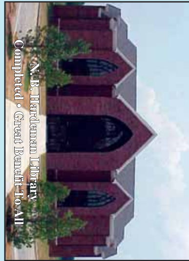
N. B. Hardeman Library Completed • Great Benefit To All