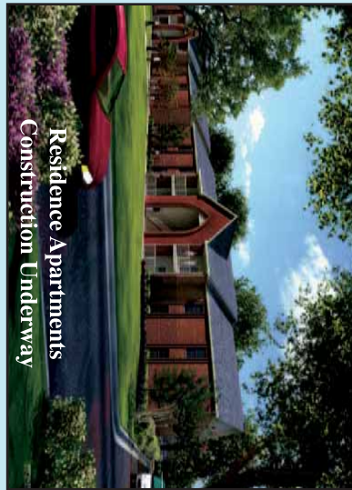
Residence Apartments Construction Underway