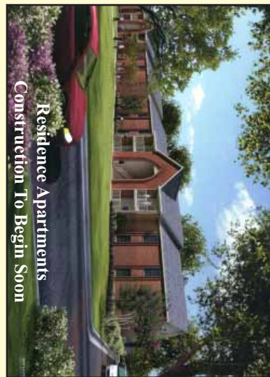
Residence Apartments Construction To Begin Soon