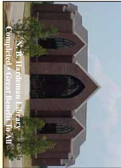
N. B. Hardeman Library Completed • Great Benefit To All